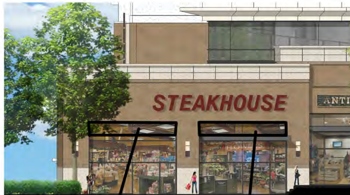
RENDERED ELEVATION SIGNAGE & CANOPY PROVIDED BY TENANT